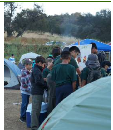
The Scouts cook breakfast early in the morning.

On Friday, May 1st of 2015, Troop 693 traveled to Firestone Scout Reservation to join in on the Spring Cen-Ten-O-Ree Camporee, celebrating the 100th anniversary of the Los Angeles Area Council. All districts under the LAAC were invited. This involved new activities: fencing, ATVs, and a triathlon. The old activities were there too: archery, shotgun, and rifle shooting. The Scouts also collaborated in making a webelos bridge. The new Scouts in Troop 693 also had great time on their first Camporee, although they did complain that the live songs provided by a graduated Eagle Scout on Saturday night were all outdated. The food was, as usual for Troop 693, excellent. All in all it was a great learning experience for the younger scouts while they had fun in such a large event.